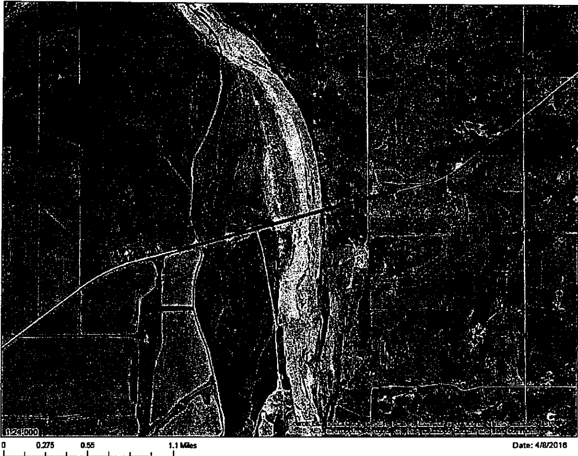
SH 79 (0282-01-016) Bridge Replacement - Clay County - Aerial Map